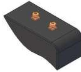
T = Male Terminals