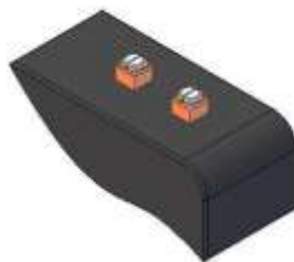
Y = Female Terminals

Y = Female (Brass with one Cup washer, one lock washer and one No. 8-32 UNC binding head screw each)