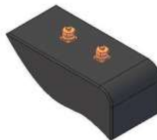
T = Male Terminals