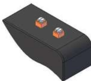
Y = Female Terminals

Y = Female (Brass with one Cup washer, one lock washer and one No. 8-32 UNC binding head screw each)