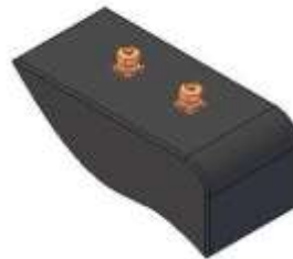
T = Male Terminals