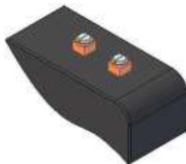
Y = Female Terminals

Y = Female (Brass with one Cup washer, one lock washer and one No. 8-32 UNC binding head screw each)