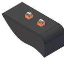
Y = Female Terminals

Y = Female (Brass with one Cup washer, one lock washer and one No. 8-32 UNC binding head screw each)