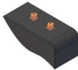
T = Male Terminals