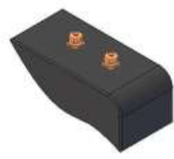
L = 16awg Lead Wire